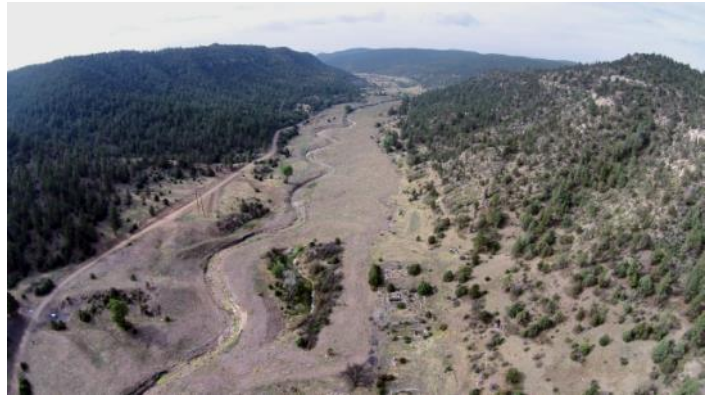
Figure 2. The new stream pathway after geomorphic reclamation of Dillon Canyon, Vermejo Park Ranch, as seen by an unmanned aircraft from approximately 600 feet high above ground, clearing utility lines and the highest peak.

A Trimble UX5 Aerial Imaging Rover, fixed wing UAS with 1 meter wing span and electric pusher propeller (figure 1), was deployed at the site in August, 2014. A 16.1 MP compact camera with custom 15mm lens was used to take high-resolution images along a programmed flight-path over the 0.16 square mile reclamation site in approximately 30 minutes (figure 2). The resulting data was used to map topography of the post-construction reclamation as well as assist in revegetation