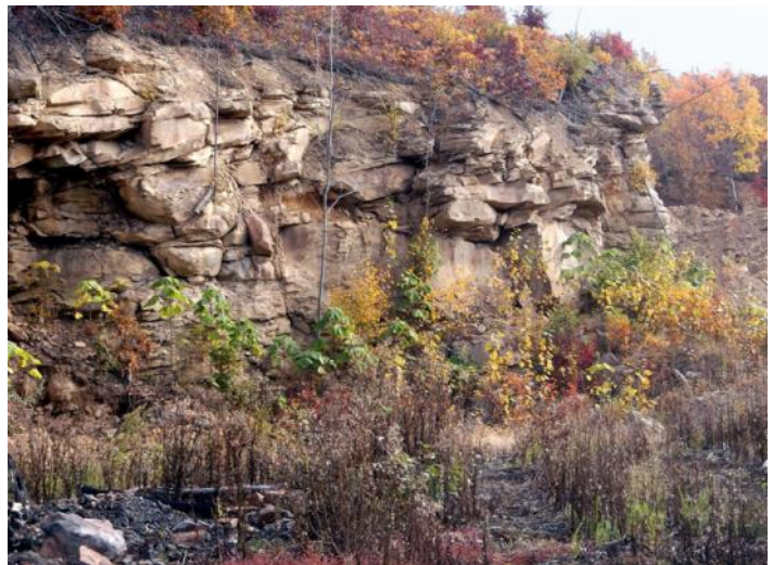
Typical dangerous high wall prior to project

This area was a dangerous attraction to local ATV users, hunters, campers, and hikers, and was visited frequently. Large numbers of ATV trails crisscrossed the area adjacent to the unstable highwalls and up steep embankments. Riders could have easily been injured or killed by rock falling from the highwalls or overturning ATV's. This area was planned to be used by the Summit Bechtel Reserve (SBR), home of the Boy Scouts of America Camp Arrow for a national high adventure camp. These hazards had to be quickly eliminated prior to construction of the camp to eliminate hazards to construction workers and the tens of thousands of participants associated with the camp.