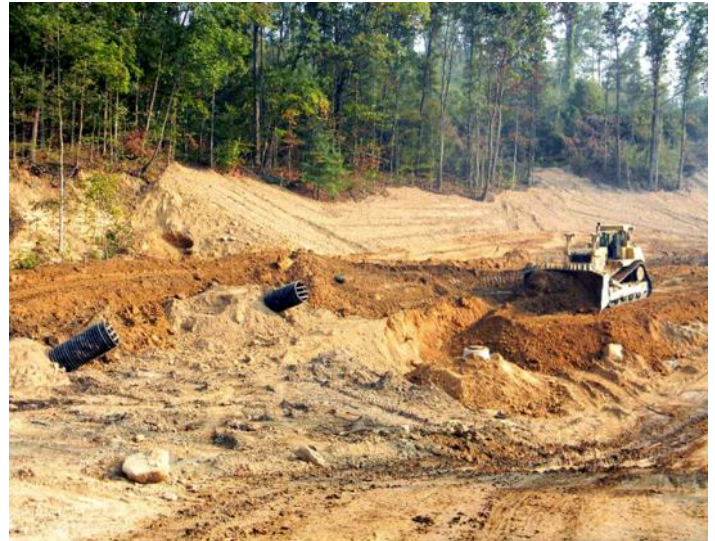
Bat friendly mine closure extensions

future construction by others of the planned (SBR). This reclamation work was done in consideration of the plans for the camp in order not to disrupt, block, delay or add to the cost of the future construction. Plans for the future Scout Camp were being changed continually, so the construction plans for the AML work was adjusted accordingly and necessary. The majority of the area was heavily timbered. Therefore cutting and stockpiling the timber, along with burning the remaining organic material, was a major task.