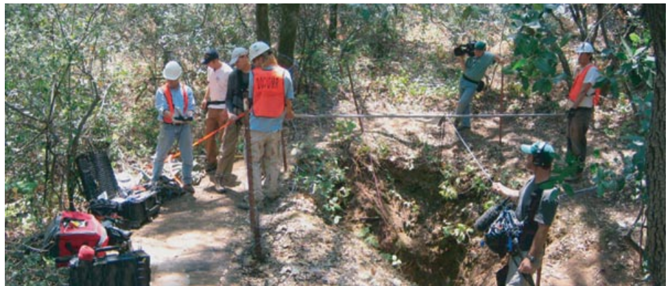
California’s Abandoned Mine Lands Unit staff and the “Dirty Jobs” film crew check the feed from a down-hole video camera lowered into an abandoned mine shaft

By Don Drysdale California Department of Conservation, Public Affairs Office (Modified from article first published in What’s Up, DOC? Volume 9, Number 9.)