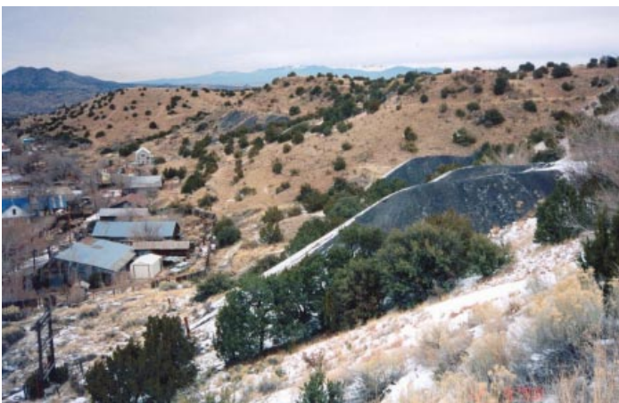
After several decades of exposure, gob piles remain without significant vegetation. The piles experience significant erosion off the steep slopes and sediment deposition onto flatter slopes and into drainages.

The restoration and dynamic stabilization of the main stream through Madrid, channelized during the mining period, would require the cooperation of several landowners and the avoidance of historic structures along the path of the stream. Given the town's current focus on arts and tourism, some landowners and community members may not want particular gob piles reclaimed, preferring that they remain in place as a part of the historic landscape that makes the town unique. Possible alternatives to removal of the gob may include: in-place revegetation, the use of sediment ponds or