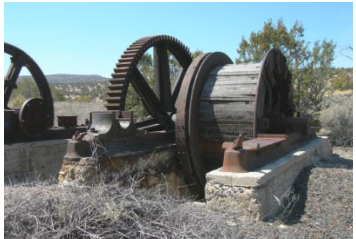
Old machinery and foundations, like the gears and pulleys from the original coal tram, dot the landscape in Madrid.

NMAMLP is currently evaluating proposals from planning, landscape architecture, and engineering firms to develop a community plan to prioritize and address problems arising from past coal mining practices in and near Madrid. NMAMLP is interested in exploring creative and innovative ways to address the impacts of historic coal mining at Madrid, while honoring its historic heritage and the goals and aspirations of the present community. The planning process will start with the identification of stakeholders; the development of baseline descriptions of the historical, social and physical aspects of the community; and the creation of an inventory of the problems associated with past mining practices, including public health and safety issues, physical dangers and degraded land, water, wildlife and recreational resources.