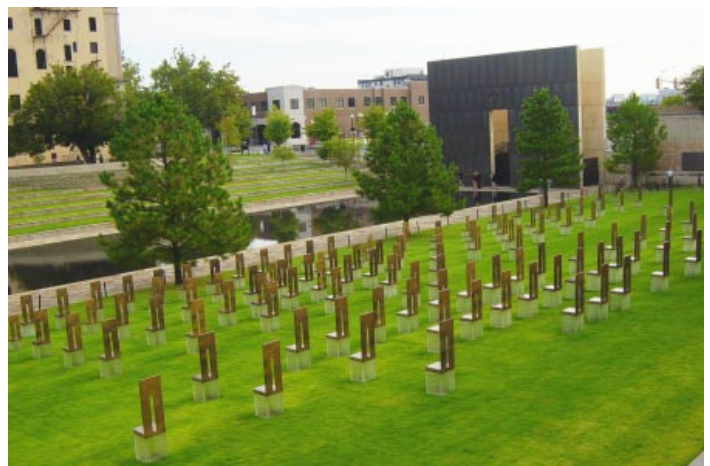
The Field of Empty Chairs, east Gate of Time, & Reflecting Pool at the Oklahoma City National Memorial.