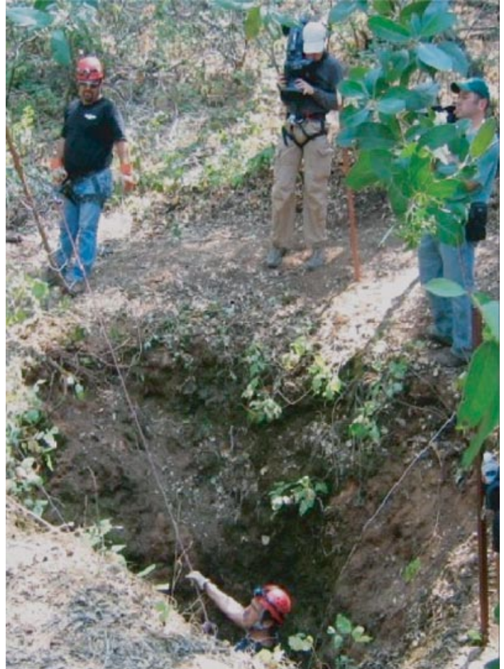
Show host Mike Rowe descends into the 50-foot-deep shaft.

One thing that seems safe to say after his work with OMR: With a newfound respect for the danger (and dirt) that comes with plugging an abandoned mine, Rowe will never get injured by venturing into one.