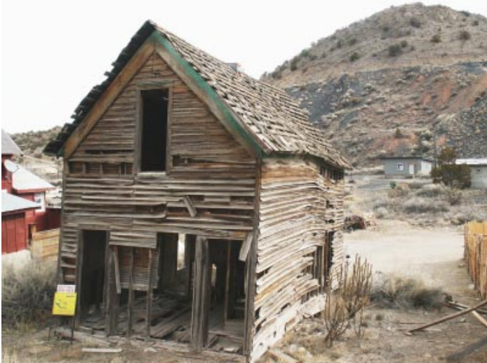
On the outskirts of town, some of the original company structures are waiting for some TLC. The original wood-frame cabins were dismantled in Kansas and brought to Madrid by train.

Since the 1980s, the New Mexico Abandoned Mine Land Program (NMAMLP) has safeguarded most of the hazardous abandoned coal mine openings at Madrid. The Program has also completed projects to control erosion, control subsidence, improve stormwater drainage and reclaim gob piles. Much of the townsite is built on or adjacent to coal gob piles, with associated problems including windblown dust, accelerated erosion and sedimentation, poor localized stormwater drainage and a destabilized stream system.