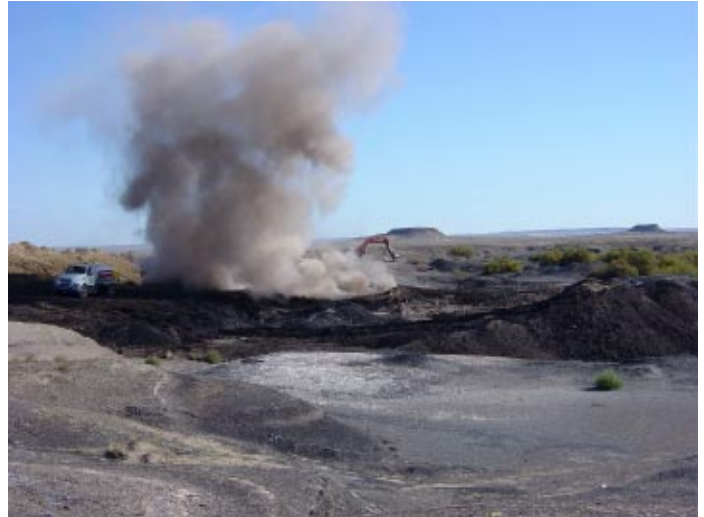
Looking to the north at the early stages of the coal outcrop fire excavation with a bulldozer. The water truck is nearby for dust suppression. Due to the amount of ash and high heat present, this was a slow excavation process.

lightening or burning trash. This project was completed within 15 calendar days using a basic cut and fill methodology. The excavated material was thoroughly mixed with water and natural soil to ensure the fire was out. This was the first coal fire project addressed by the Navajo AMLR Program.