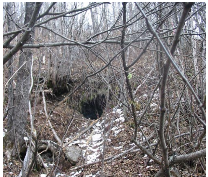
Old mines lure bears in Alaska