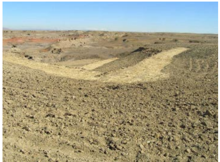
(Before) Looking to the northeast. The combination of the excavator and bulldozer are excavating the coal fire seam while the water truck is providing water from an above bench. The excavation process is being performed in a series of cuts working up to three (3) levels. Following the full excavation, the overall area was backfilled with a series of natural benches for drainage control.

In 2005 a local individual reported that another coal outcrop fire was burning near their residence located on a flat plain adjacent to Chaco River. The second coal fire project consisted of