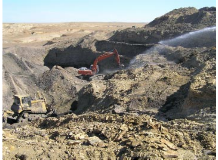
(After) Looking to the northeast. The final contour of the coal outcrop fire with multiple benches for drainage control installed. Some revegetation was implemented and overall rough grading installed.

Senior Public Information Officer: hcharley@frontiernet.net