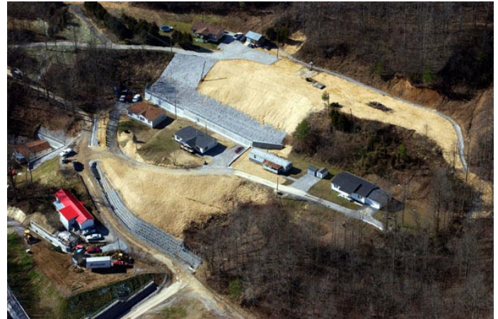
Aerial view of the completed Belfry Project