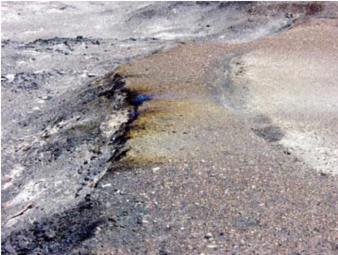
Looking south at the coal outcrop fire line. Fire is progressing to the west. You can see the ash to the left and the smoke in the middle and the natural ground to the right.

Window Rock, AZ (Navajo Nation) - The natural carved formation made of gray and white clay creates a natural beauty called "Bisti tah" (Badland) and Chaco River Valley, a scenic attraction that many tourists travel to northern New Mexico for viewing and photographing. There is a small Navajo community called Burnham, with approximately 200 Navajo families residing within a 25 mile radius along the historic highway 666 (renamed to Highway 491) which is north between Gallup and Shiprock, New Mexico. Within the Burnham area lies a large coal reserve with an estimation of over 2 billion tons. Currently, there are three large strip mining operations on the Navajo reservation with approximately 18 million tons of coal that is mined on an annual basis. The coal strip mining industries contribute to the economy of the Navajo Nation and provide coal to operate three (3) power plants which light-up the Western United States and the surrounding areas. The Navajo Nation also receives Mineral Royalty Payments and AML funds through coal taxes pursuant to the Surface Mining Control and Reclamation Act (SMCRA) of 1977.