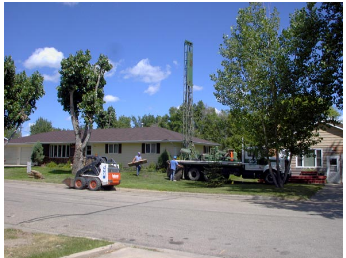
Drilling on Garrison Project