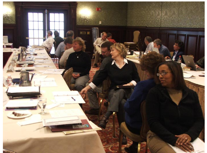
Coalfields Communications students in class