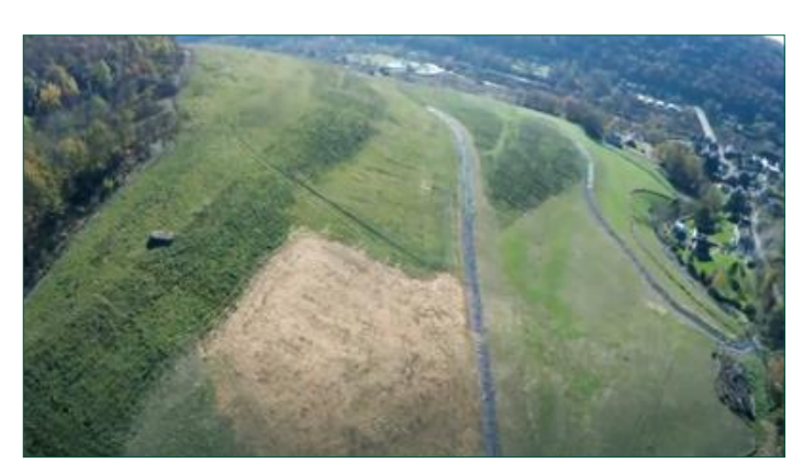
Pennsylvania Department of Environmental Protection Bureau of Abandoned Mine Reclamation