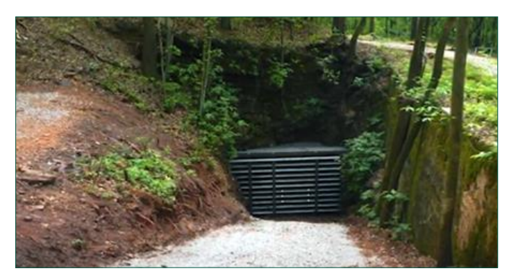
Alabama Department of Labor Abandoned Mine Land Reclamation