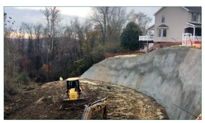
Watch a video about the Ridgeway Drive Slide