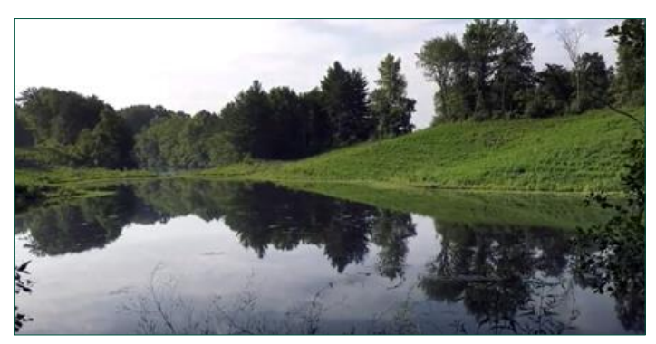
Indiana Department of Natural Resources Abandoned Mine Land Program