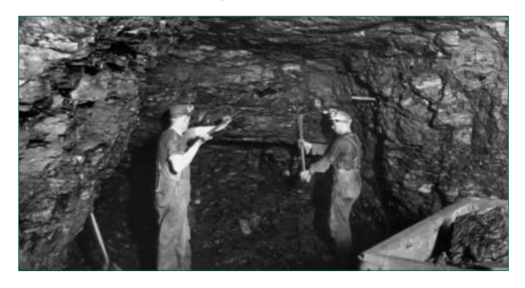
Watch a video about the Carrick Mine Project

A 20-acre abandoned mine site located near two popular recreation areas contained dangerous highwalls and a large, water-filled pit. The site not only posed a hazard to the public, but also raised liability concerns for private landowners who used the property as horse pasture and a hunting area. North Dakota's AML program addressed these issues by eliminating approximately 1,300 feet of dangerous highwalls, creating a pond that recharges fresh water, and preserving a prehistoric, petrified tree stump, estimated to be between 55 and 60 million years old.