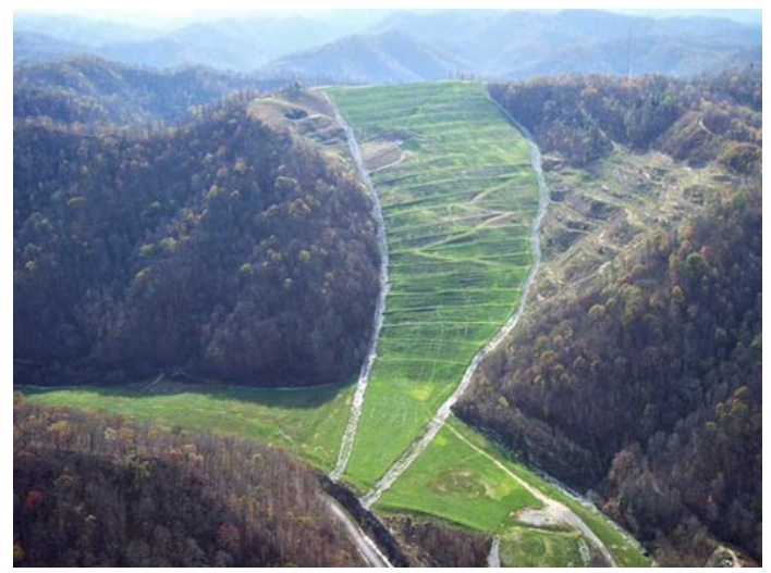
View of Project After Reclamation

After the Buffalo Creek waste dam failure in West Virginia, the Spewing Camp refuse dump received serious attention from MSHA and the Kentucky Division of Water Resources. The agencies were concerned that the refuse could slide into Spewing