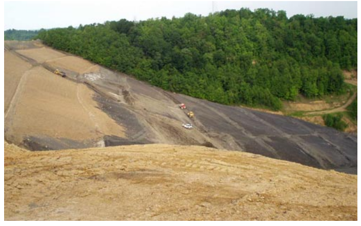
Reclamation in progress

In the late 1980s, a company named Enerpro attempted to extract the coal from the refuse on-site by running it through a