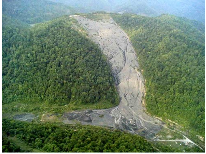
Aerial View of Refuse Prior to Project

Funding for the Spewing Camp Branch Refuse Project came from four different sources. The primary source, contributing $2.1 million, was the Commonwealth's Federal Abandoned Mine Land Grant. Also, $723, 297 in funding from the Appalachian Clean Streams Initiative, made available by the federal Office of Surface Mining, was used. DAML also contributed $406,665 from the state supplemental reclamation fund to supplement the forfeited Enerpro reclamation bond.