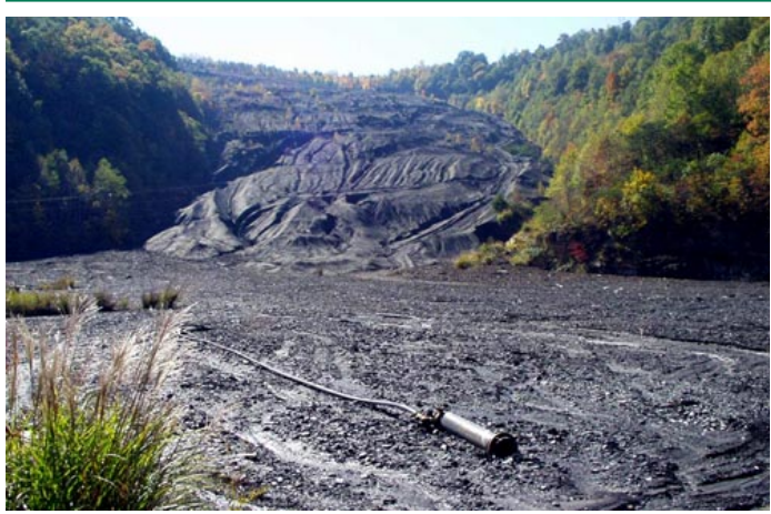
Refuse Dump on Spewing Camp Branch

Camp Branch creek and dam it up. Failure of that dam would cause catastrophic downstream flooding. Because of this concern, the creek was relocated to its present channel, farther away from the dump.