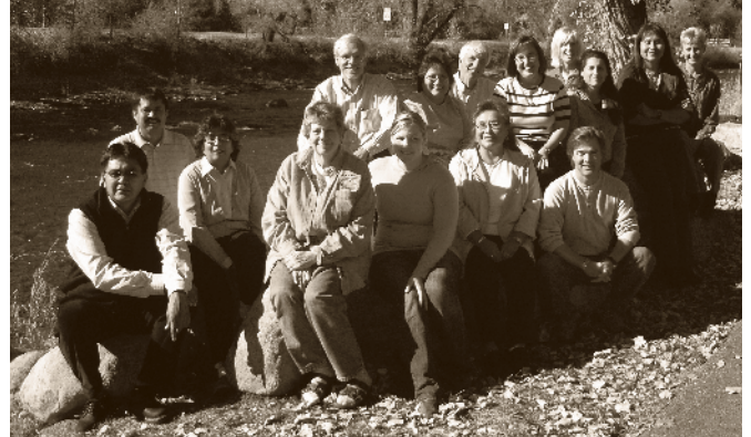
the 2008 NAAMLP Conference Committee

We are pleased to be hosting the 30th Annual National Association of Abandoned Mine Land Programs Conference. "From Four Corners to All Corners: Connecting For Reclamation" brings together AML reclamation specialists from every corner around the country. We have over 30 technical sessions ranging from reforestation and protecting bat habitat to saving historic structures, and watershed restoration.